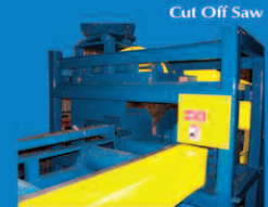
Cut Off Saw

Our history of SATISFIED CUSTOMERS speaks for itself. We thought it was time to share the good news about our great products with the rest of the world.