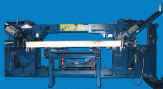
End Plating Press

MAKES THE EQUIPMENT FOR YOUR TIMBER PROCESSING NEEDS